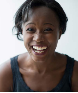
Shadows on face